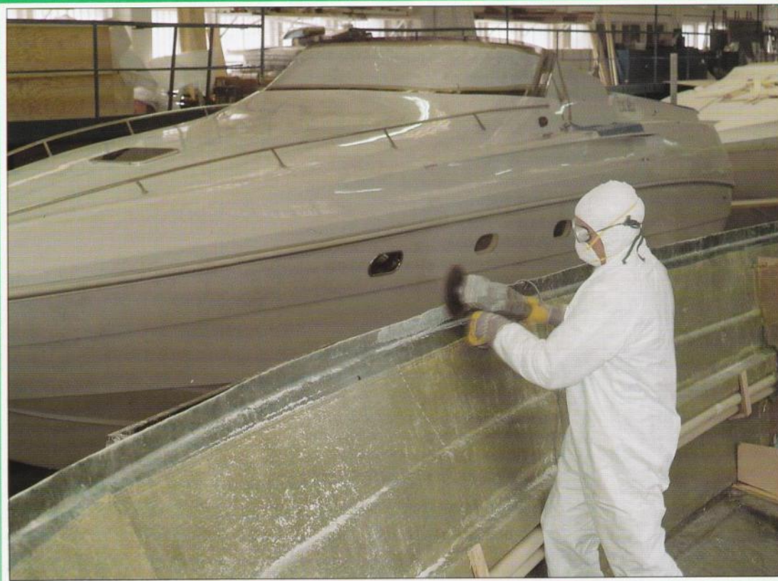
"ZEC, SEMIFLEX® grinding Fiberglass boats ABBATE Co. - Italy